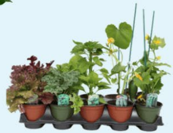
Herbs & Veggies